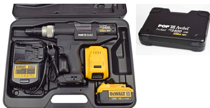
Robust tool case for outdoor installation. Different battery configurations available.*