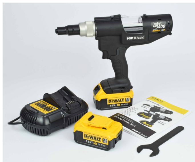
Tool delivered in sets with 18V DEWALT XR Li-Ion batteries* including fast charger and ø 6.4 mm flat nose piece equipment.