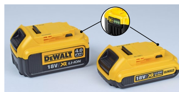
2.0Ah or 4.0Ah batteries available. All batteries with charge indicator.

Weight: 2.10 kg including 2.0Ah battery 2.42 kg including 4.0Ah battery